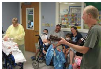
The Connection Lounge is a packed house for music therapy!