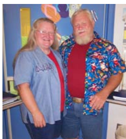
Santa and Mrs. Claus took some time from their summer vacation to visit 5200

This month has brought a lot of very special visitors to the PBMT unit. Mr. and Mrs. Claus made a long trip down from the North Pole to provide Christmas in July for PBMT patients. With them they brought an array gifts for everyone. Another visitor to the PBMT unit came all the way from Disney World in Florida. Patients could hardly control their excitement when they saw Mickey Mouse outside of their room. Thank you to everyone who made these very special visits possible.